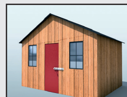
USE FOR WENDY HOUSES & DOG HOUSES